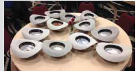
White Hats on Display: Traditional Stetsons, known as the "White Hats" on display at the SWRA Regional event.

As explained in RSES News in the June 2021 issue of RSES Journal , the history of the White Stetson is a tradition that has been a part of the SWRA for more than 50 years. The hats signify those who are currently serving the Region as Presi-